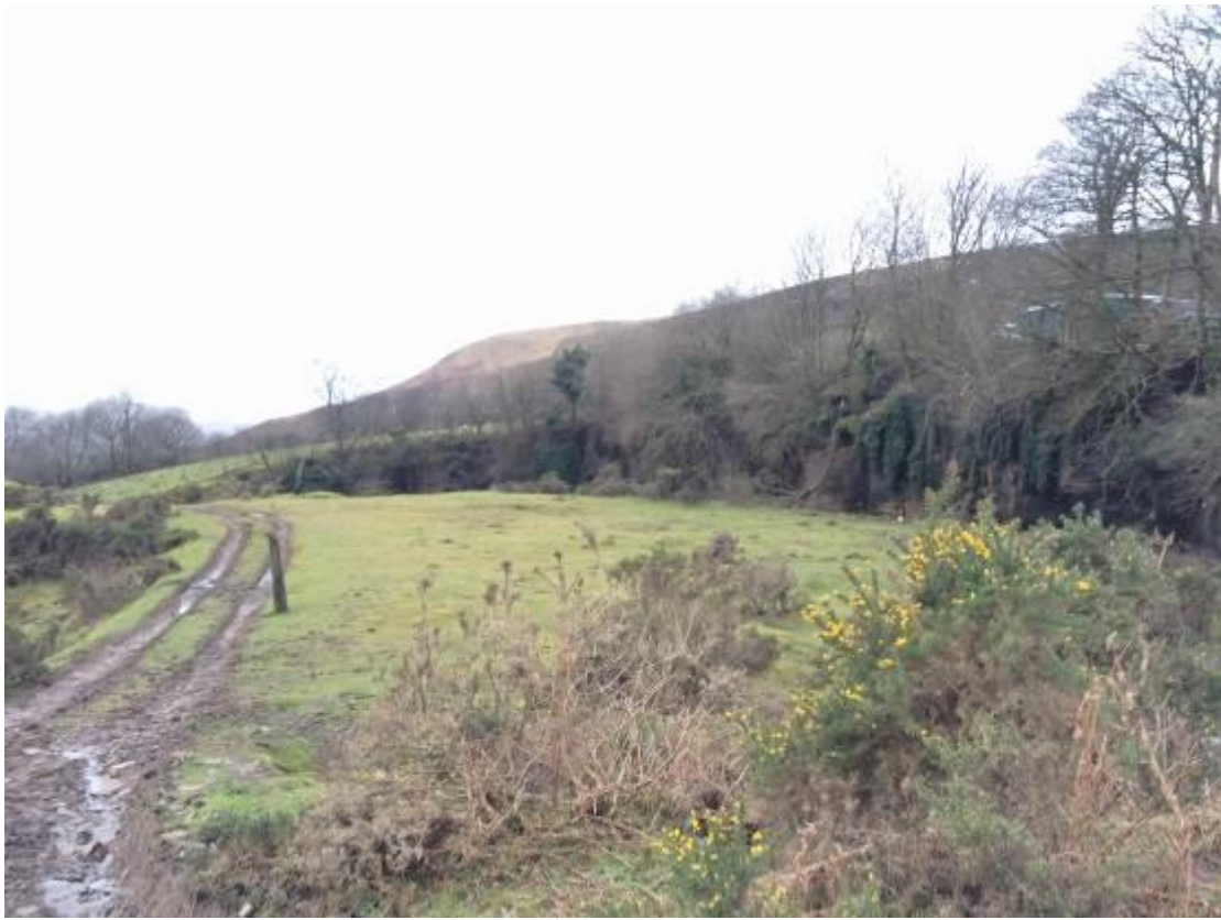
Photograph 2 – Quarry floor