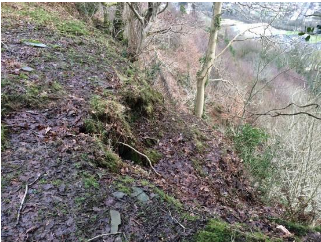
Photograph 14 – Minor slumping at crest of cliff to south east corner