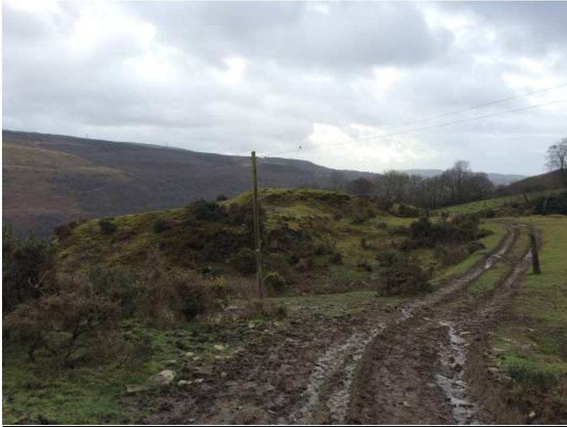
Photograph 1 – Access to quarry floor