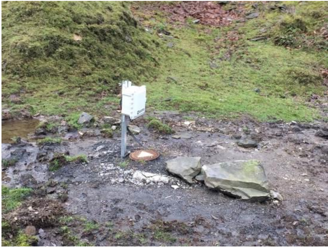
Photograph 11 – Recently installed borehole and data logger installation