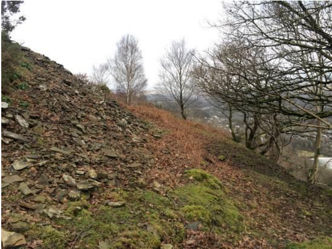
Photograph 13 – Toe of spoil mound along cliff edge