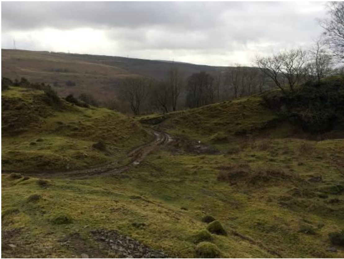
Photograph 8 – General view of part vegetated spoil mounds