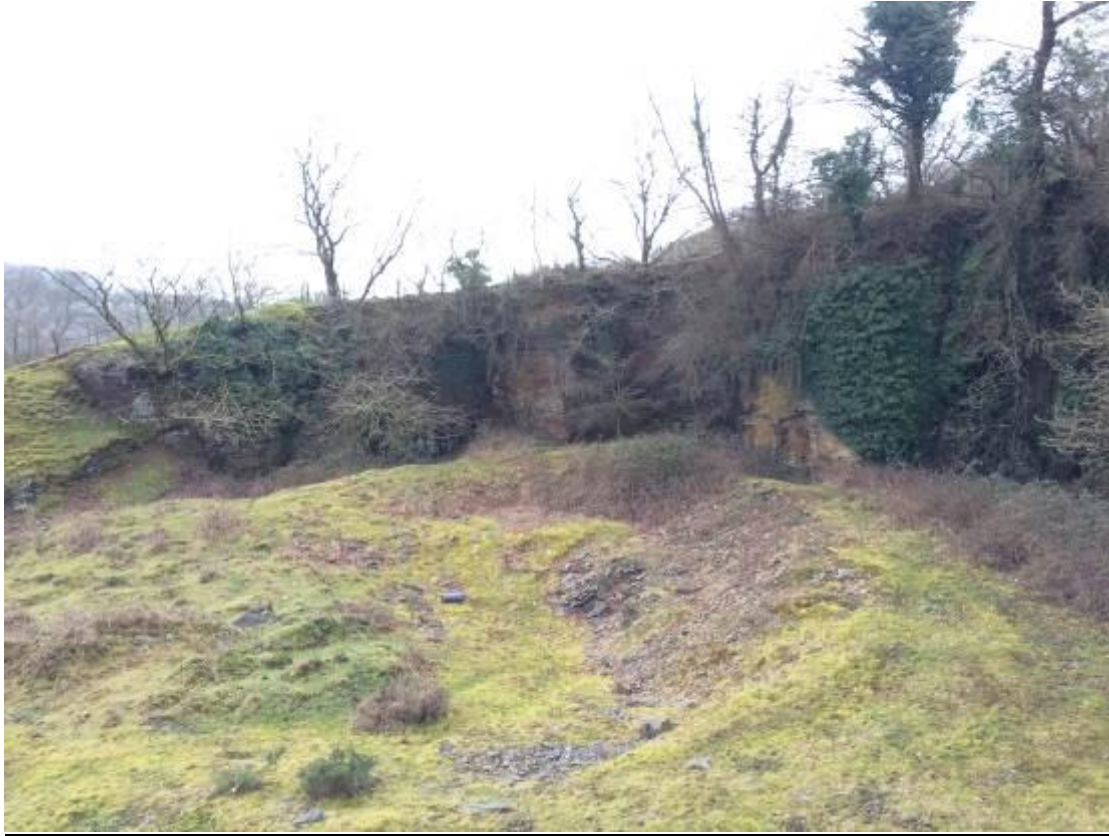
Photograph 7 – General view of part vegetated spoil mounds