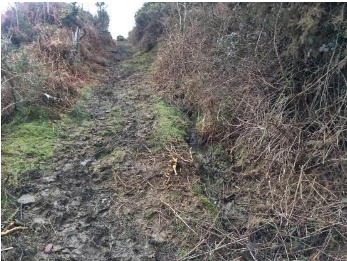
Photograph 18 – Small issue of water alongside access track