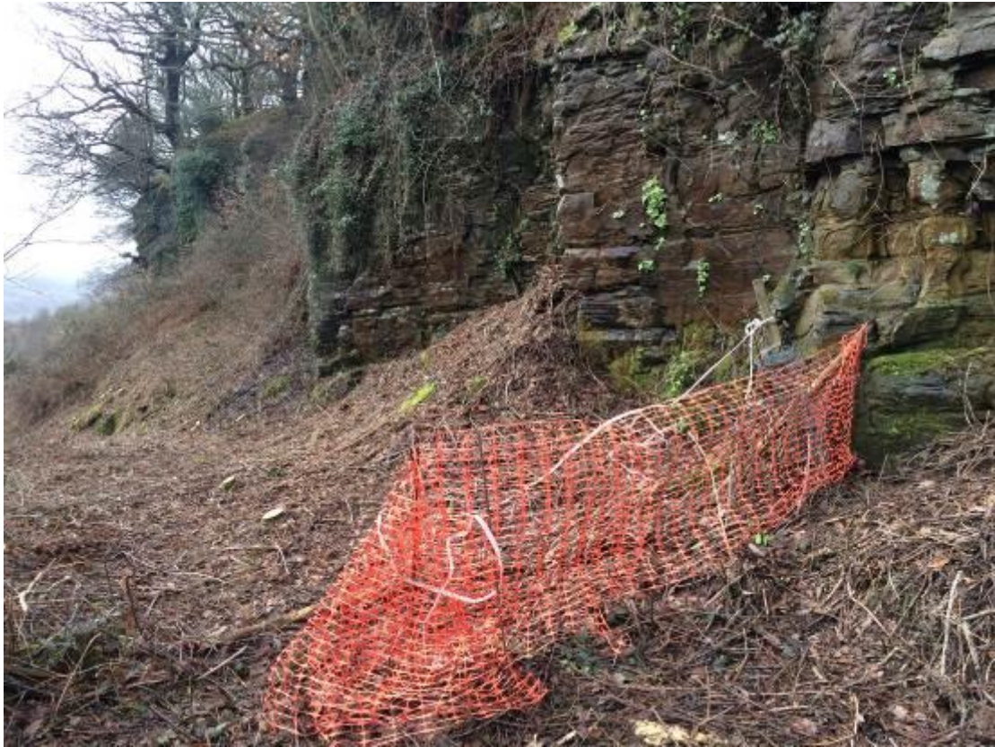
Photograph 21 – Base of cliff face along lower bench