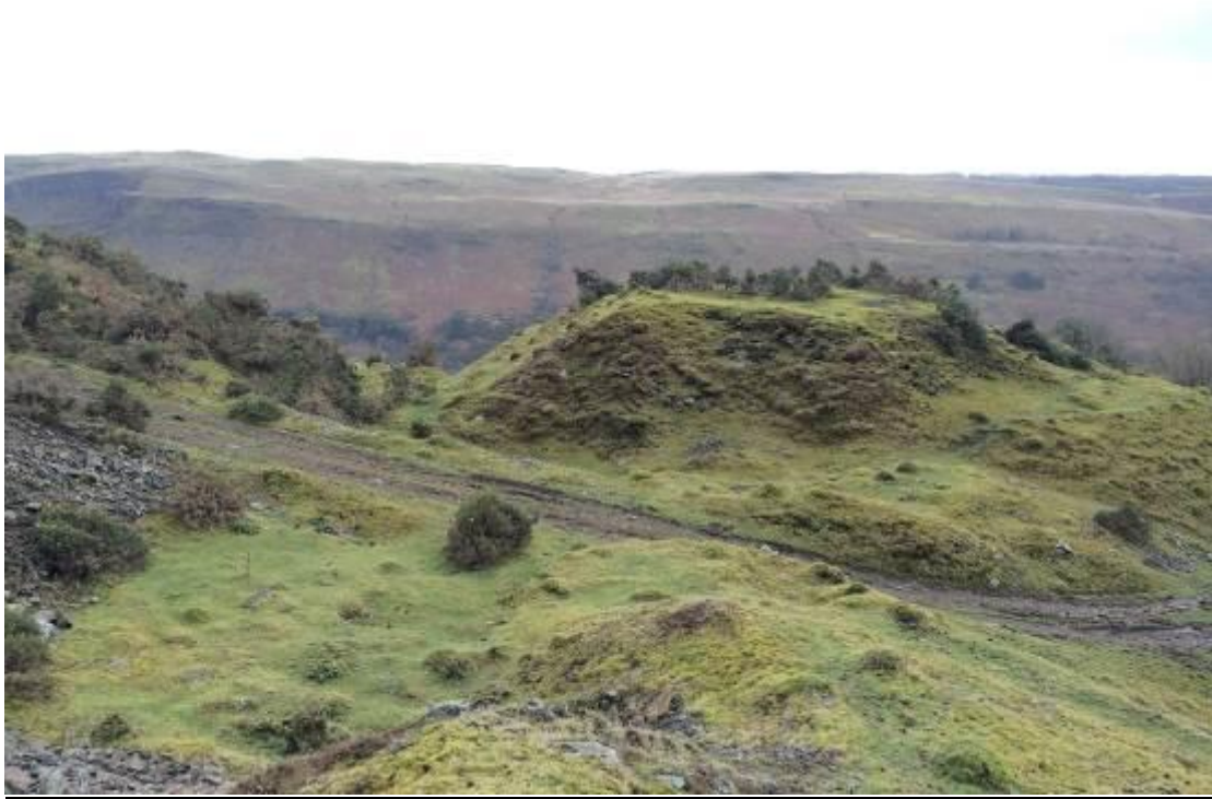
Photograph 9 – General view of part vegetated spoil mounds