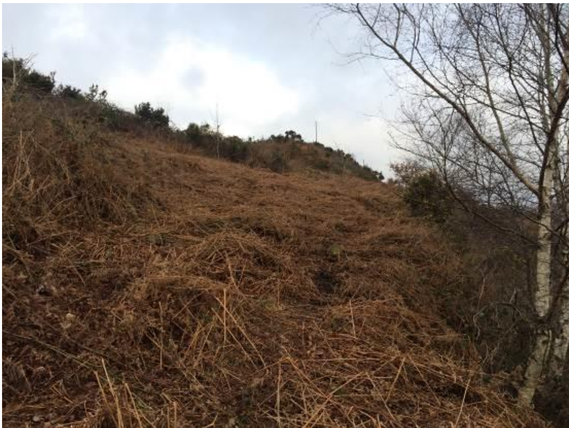
Photograph 16 – Access route cleared through bracken