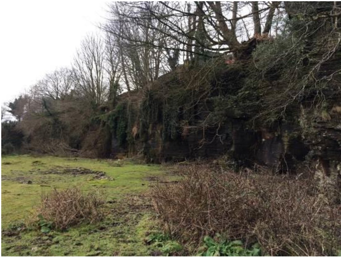
Photograph 4 – Quarry high wall showing vertical face