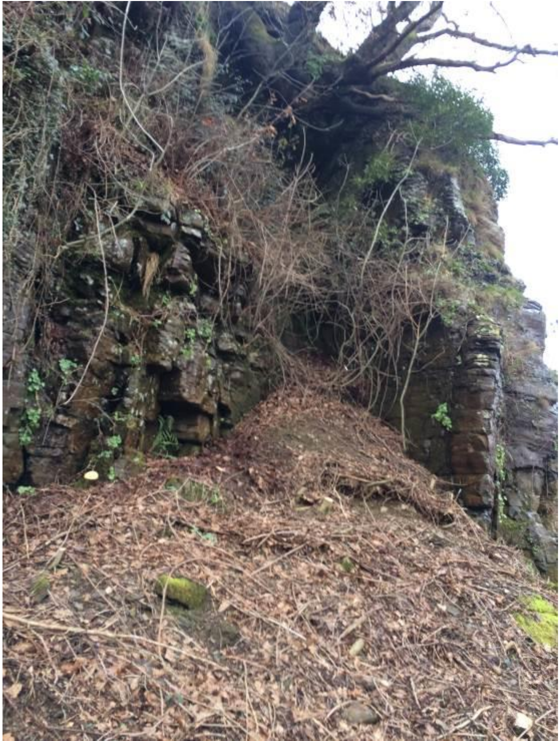
Photograph 23 – Slumping of debris from crest to toe