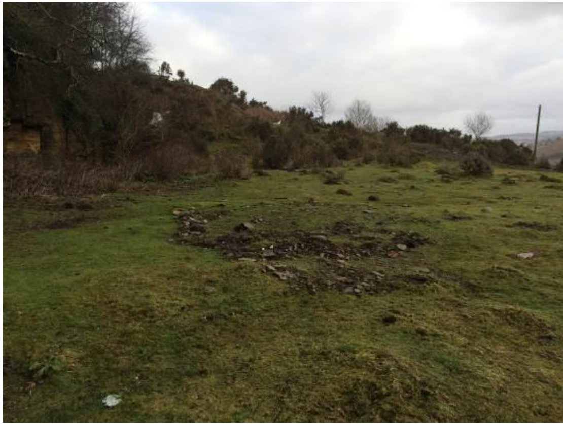
Photograph 5 – Ground disturbance from recent investigation works