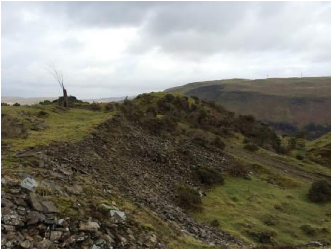
Photograph 10 – Bare spoil mounds at northern edge perimeter of site