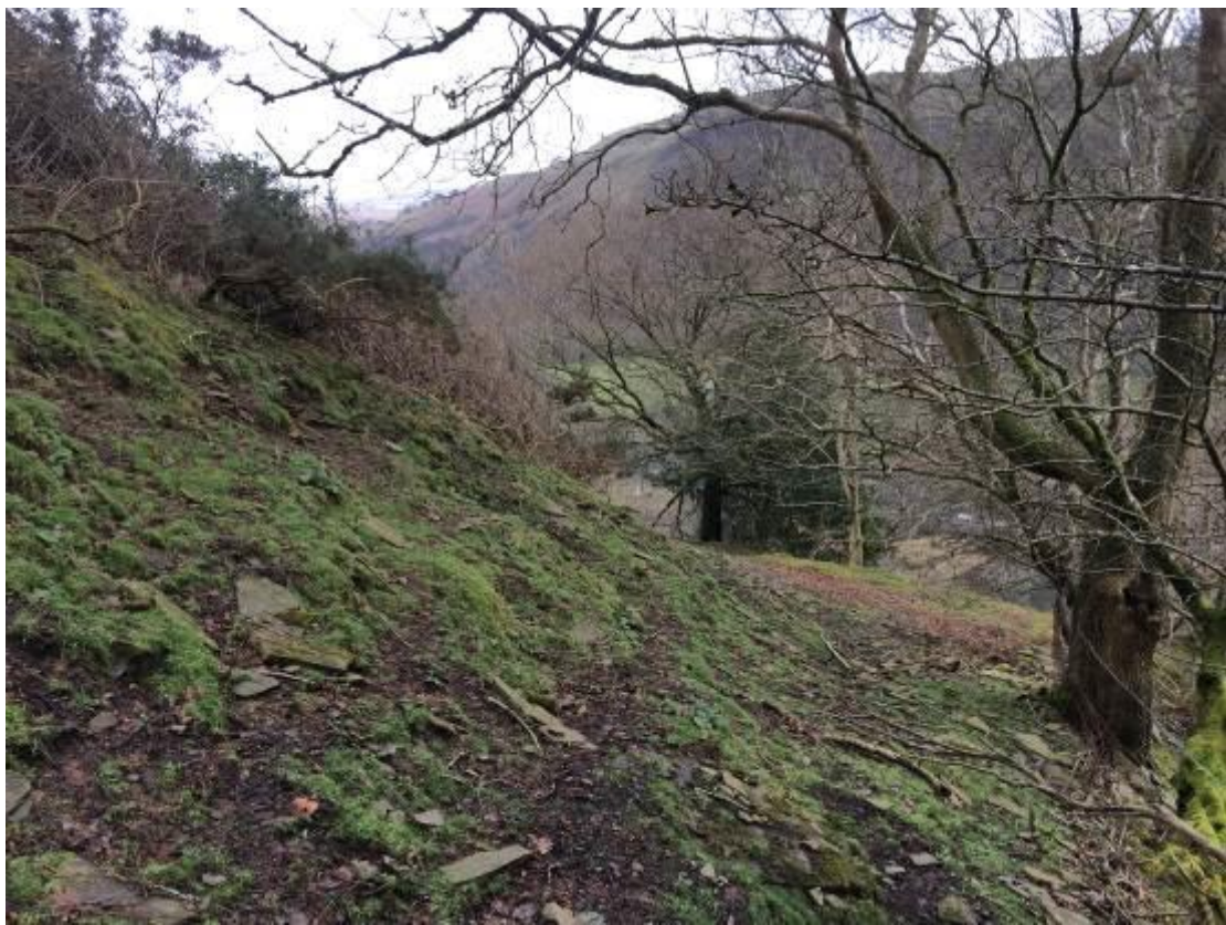
Photograph 12 – Part vegetated south east flank above cliff face