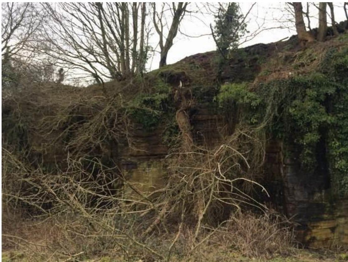
Photograph 6 – Fallen trees at crest of high wall