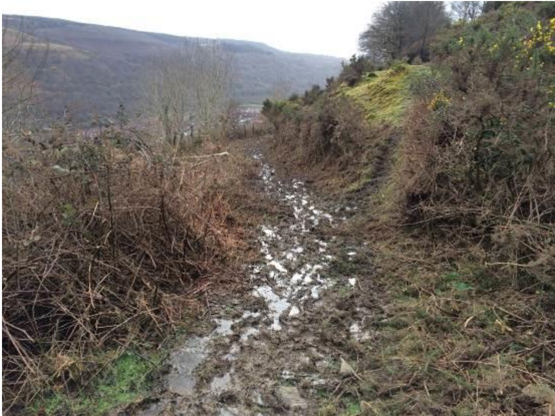
Photograph 19 – Water flowing along route of access track