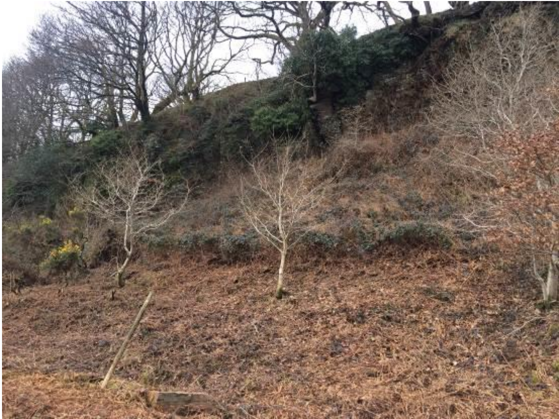
Photograph 26 – General view of lower bench