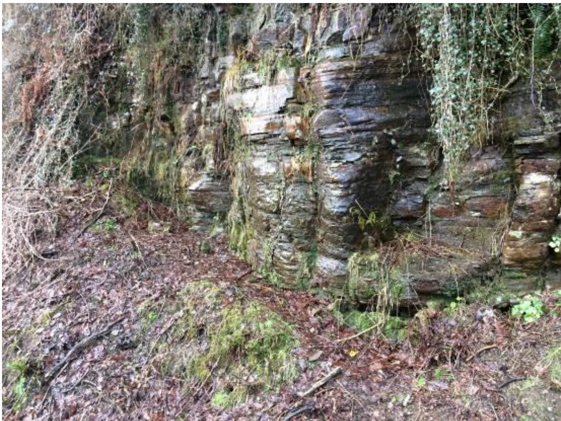
Photograph 22 – Moderate seepage from cliff face