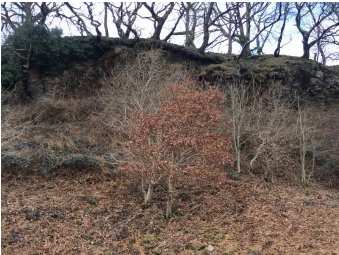
Photograph 25 – General view of lower bench