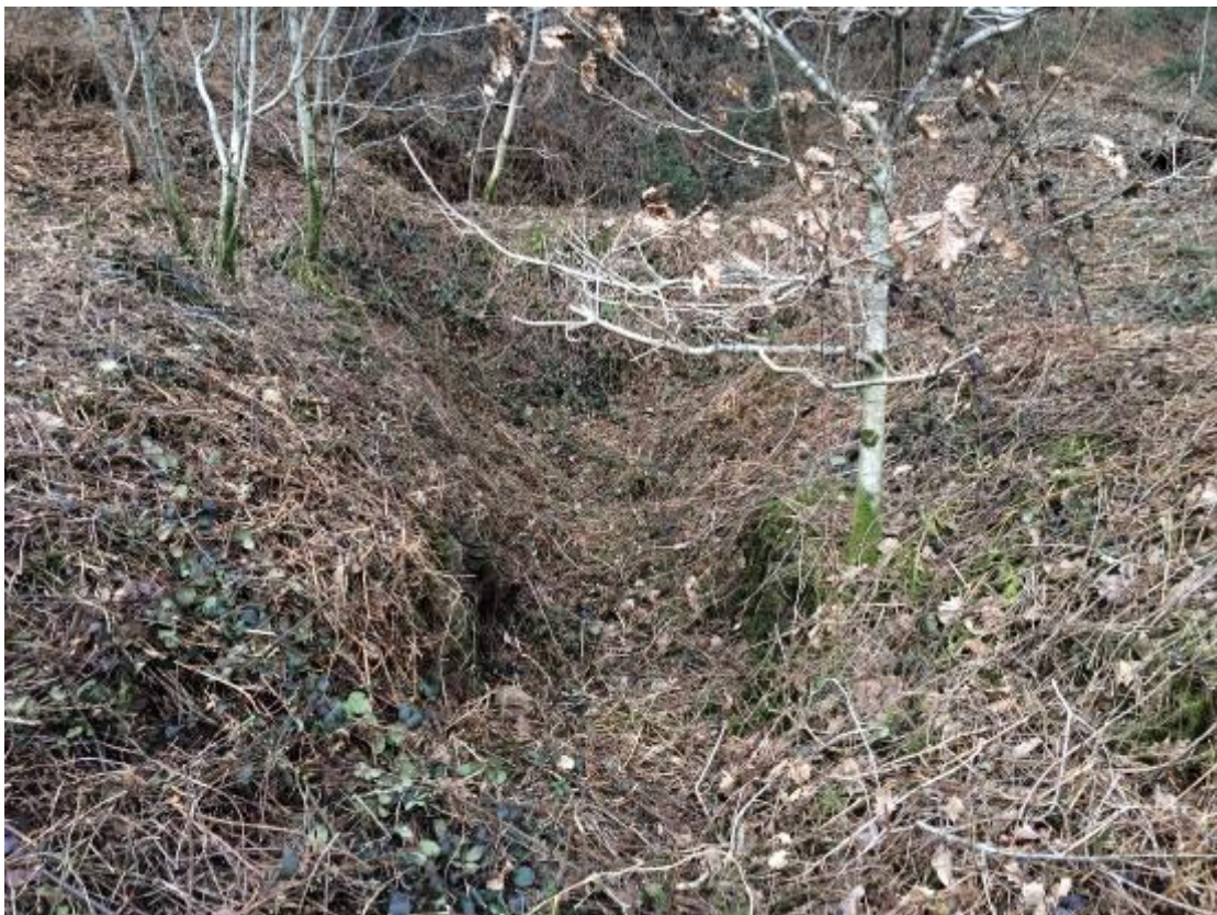
Photograph 27 – Location of adit ref: 276208-040