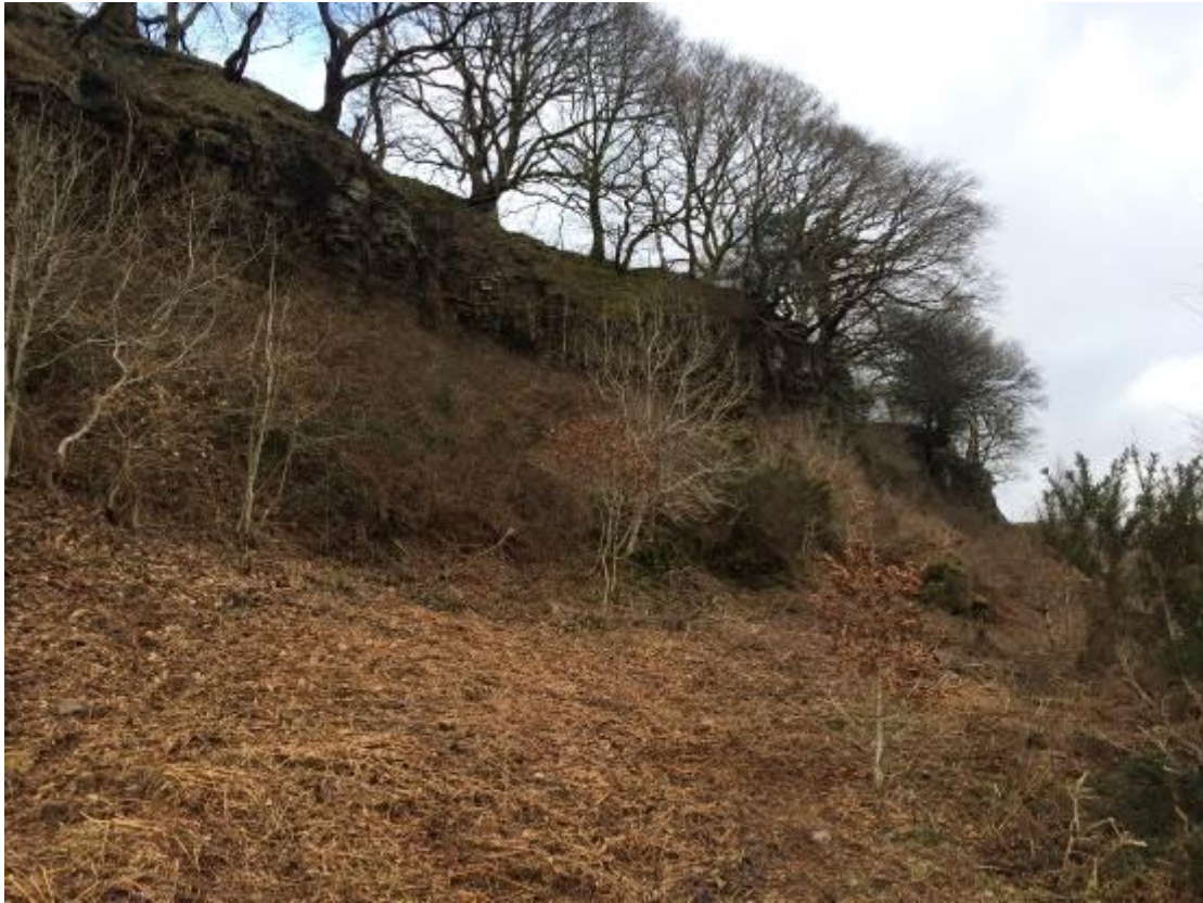
Photograph 24 – General view of lower bench