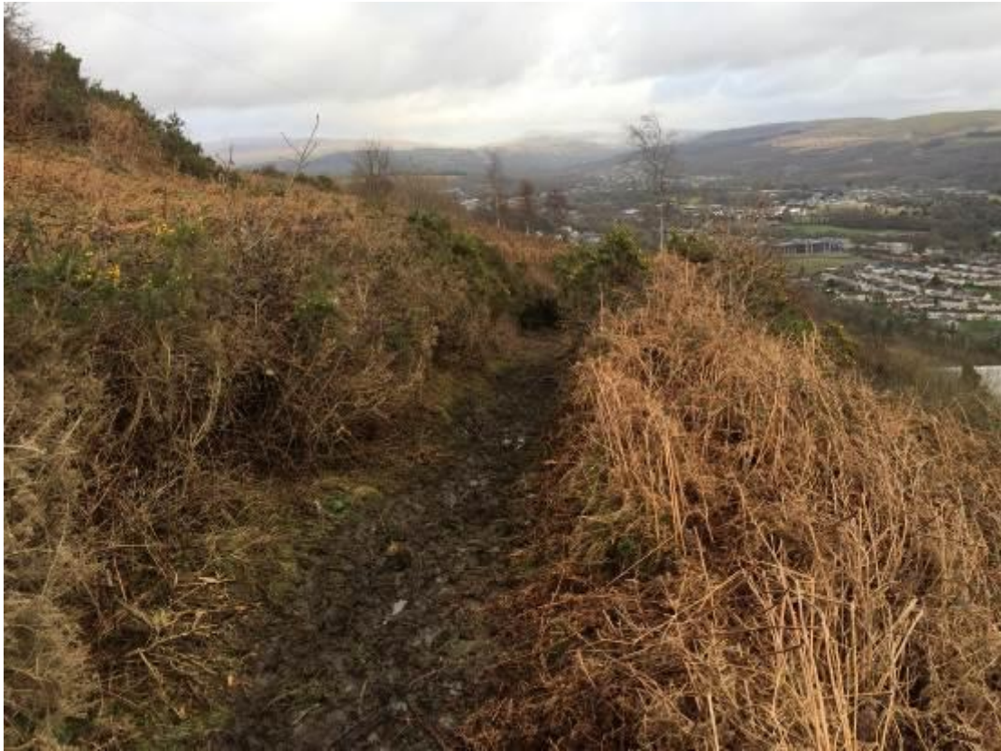
Photograph 17 – Access track cleared to lower bench