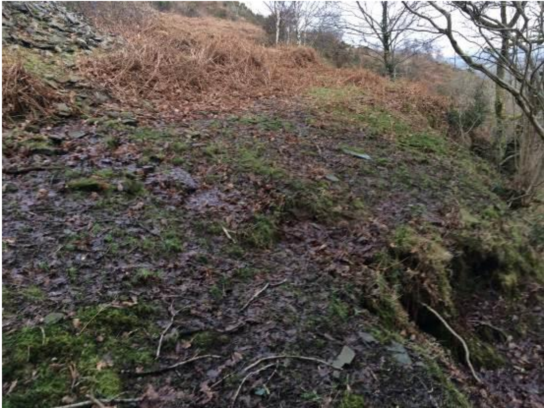
Photograph 15 – Flow of water from toe causing cliff edge slumping