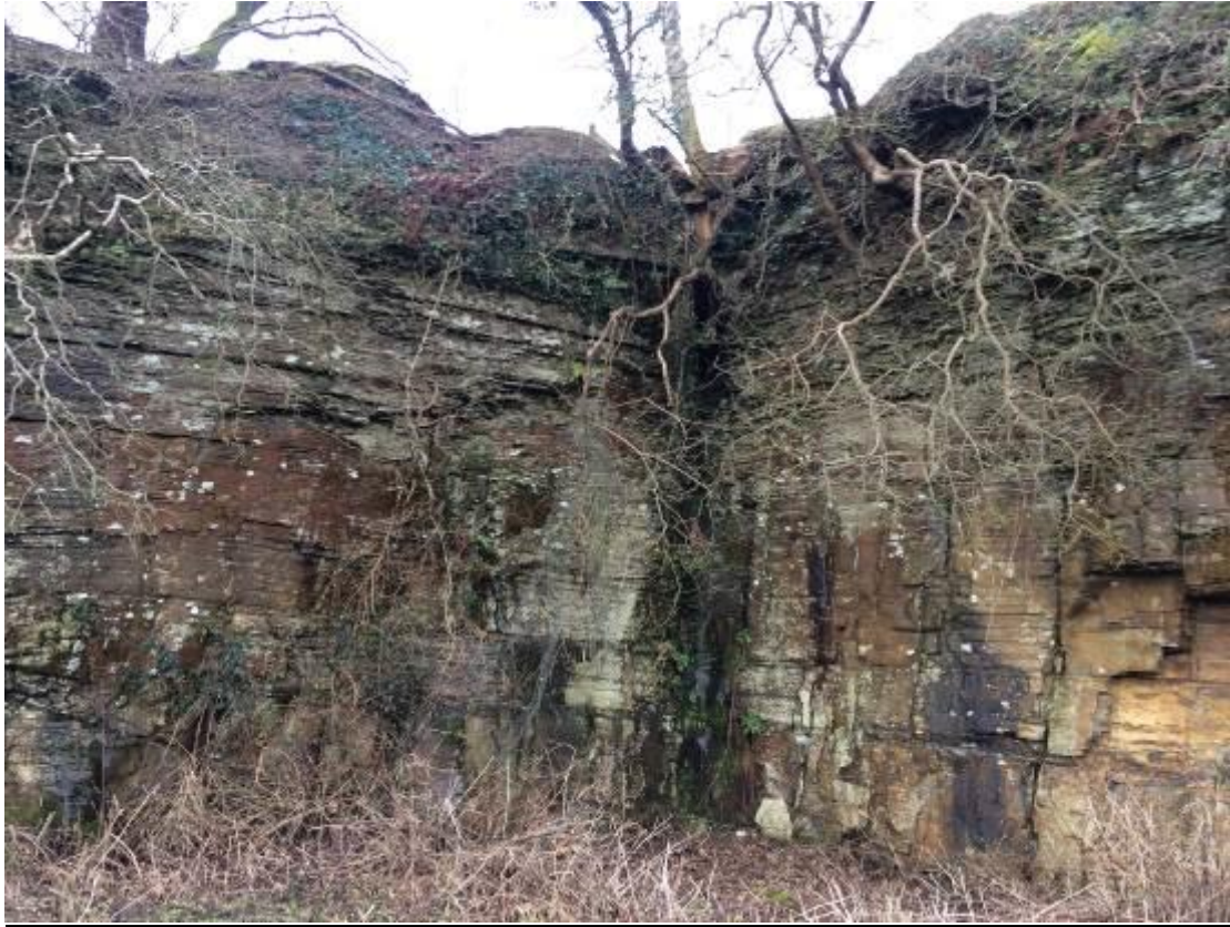
Photograph 3 – Quarry high wall showing seepages