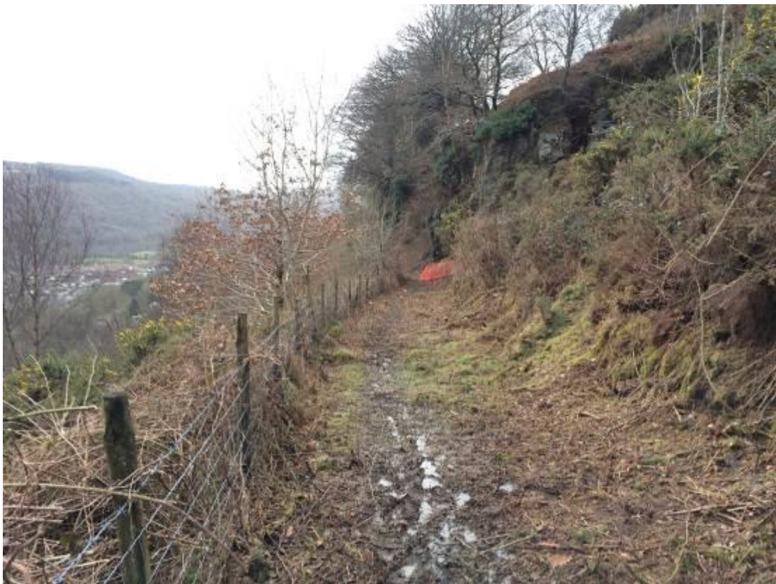
Photograph 20 – Surface water flows disappearing to ground